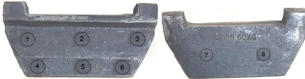
Figure-1- Reference area for checking coating thickness on Galvanized Metal Liner

6.10.3.2 If the number of defective galvanized Metal liners in a lot exceeds the acceptance number as per column no. 9 of Annexure VII of this standard, the lot shall be rejected.