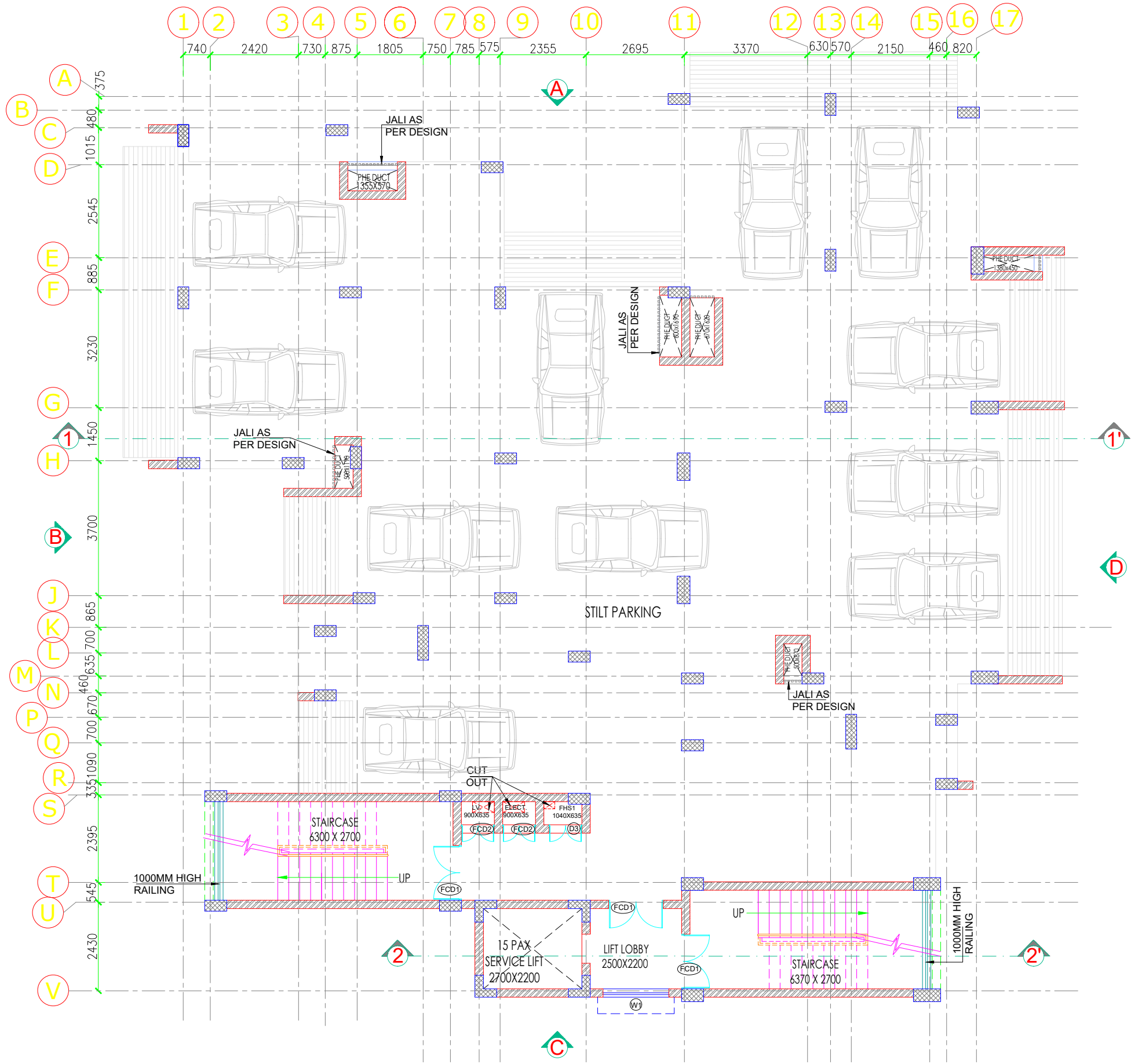
STILT FLOOR PLAN