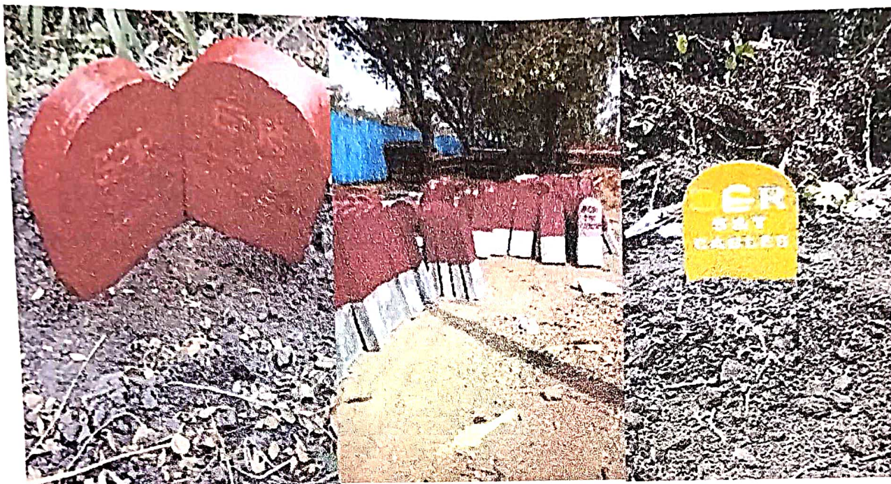
RCC CABLE ROUTE MARKER