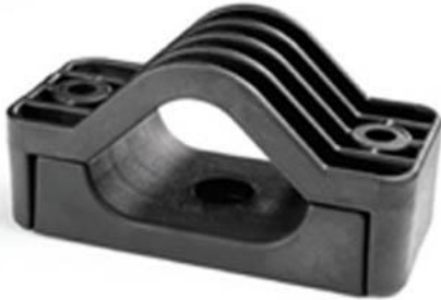
Glass Filled Polymer