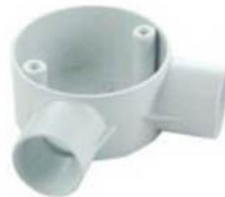
2 Way Box (Angle)