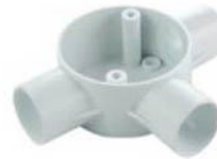
3 Way Box