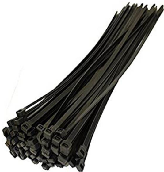
Self Locking Nylon Wire Ties