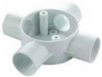
4 Way Box / Cross Box