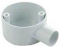
1 Way Box