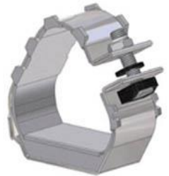
Stainless Steel Cleat