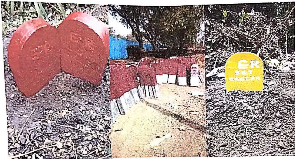
RCC CABLE ROUTE MARKER

SAMPLE PICTURES FOR ILLUSTRATION PURPOSE