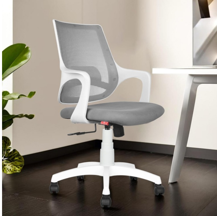
LOW BACK revolving & tilting CHAIR

Item No.9 VISITOR CHAIR : Providing and supplying Visitor or Guest chair the seat & back are made 12mm thick hot pressed plywood upholstered with changeable fabric upholstery covers (as per requirement) and molded PU foam, together with molded seat & back covers. The back foam should be designed with contoured lumber support for extra comfort. The size of chair 45cm x 38cm (back side) and 45cm x 43cm (seat side). The PU foam should be with powder coted MS structure as per architect selection. The seat and back fixed with MS structure with required necessary hardware.