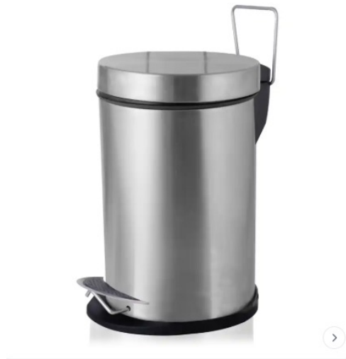
Stainless Steel Dust Bin

Item No.13 Providing and Arranging Three Seater Gang Seater having seat and back made from CRCA Tubular frame welded with perforated Diemoulded CRCA sheet. base frame made from round Tubular welded with horizontal beam Two side armrest welded with frame including finishing metal parts with epoxy polyster powder coating of 50 micron thickness Including all materials and labour etc. Complete as per drawing and instruction of engineer-in-charge & overall weight of unit shall not be less than 35 kg. 3 Seater S.S.Gang Seater: size-1590mm x 480mm x 880mm