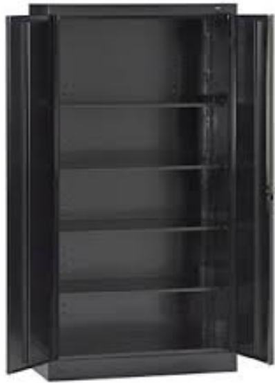
Double door stainless steel cupboard

Item No.6 HIGH BACK revolving & tilting EXECUTIVE CHAIR : Providing and Supplying High back Chair for conference with M.S frame work. Upholstered with Artificial leather/Leatherette and molded PU foam, together with molded seat & back covers. The back foam should be designed with contoured lumber support for extra comfort. Caster of high durability & hydraulic. The chair should have cylinder with 5 years" warranty. The size of chair 53cm x 79cm (back side) and 51cm x 49cm (seat size). The PU form should be molded with density=45+ 2 kg/m 3 . with One piece armrests are scratch and weather resistant. The permanent contact mechanism is designed with 360° revolving type, 12° seat tilt 19° back tilt, Front pivot for tilt with feet resting on ground ensuring more comfort, Tilt tension adjustment, 5 position locking with anti-shock back mechanism, Which should prevent the backrest from impacting the user when the lock is released, static seat depth adjustment=0.5 cm 5 position locking.