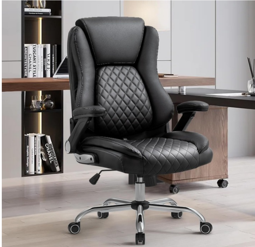
HIGH BACK revolving & tilting EXECUTIVE CHAIR