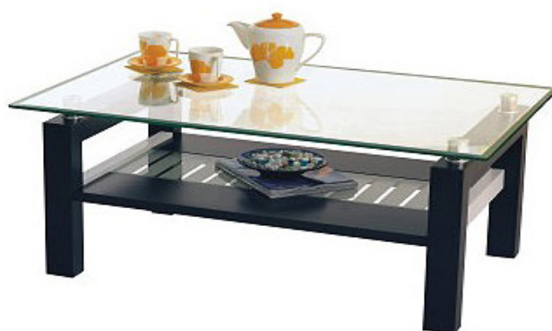
Centre Table/ Corner Table/Tipoi

Item No.12 Providing Stainless Steel Dust Bin in cylindrical shape with steel pedal and lid Garbage bin for washroom , kitchen, bathroom and office of size 7 " x 11' - 05 Litre as directed by Engineer-in-Charge.